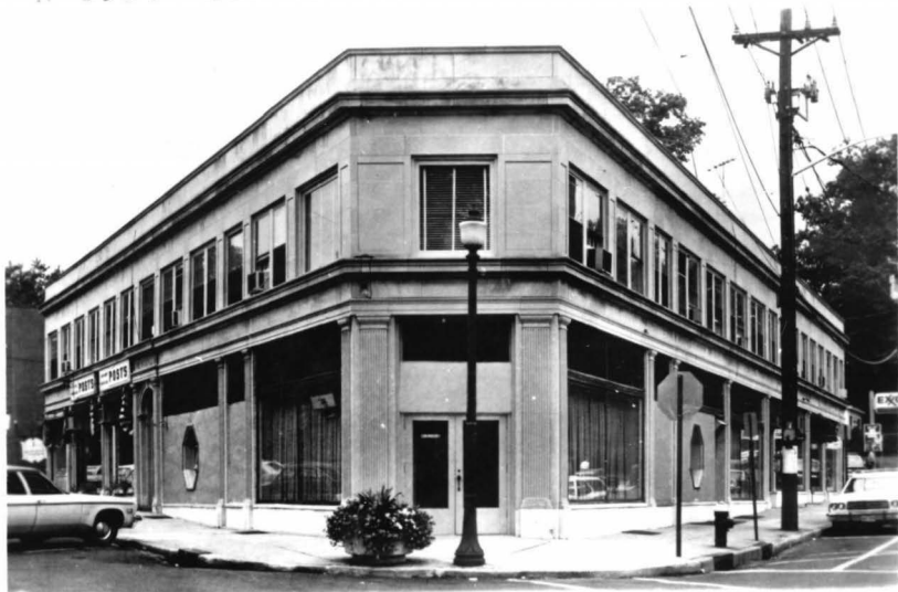
Board of Realtors of the Oranges and Maplewood